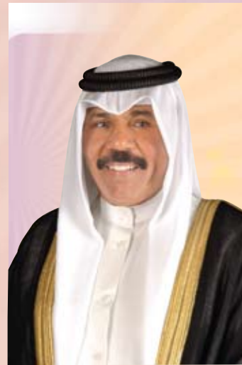
His Highness Sheikh Nawaf Al-Ahmed Al-Jaber Al-Sabah Crown Prince