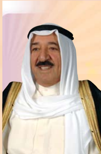
His Highness Sheikh Sabah Al-Ahmed Al-Jaber Al-Sabah Amir of the State of Kuwait